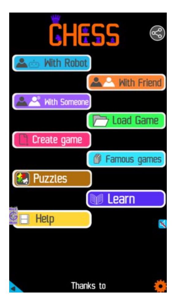
Figure 2: Play chess online for free. Solve puzzles and play with friends

Play chess for free at https://gbud.in/chs